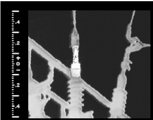
Figure 3 - Thermogram of overheating circuit breaker bushing.

Infratech offer a comprehensive survey service. On completion of the survey we present our customers with a comprehensive report tailored to suit their requirements. This may include the following: